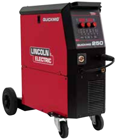
QUICKMIG® 250 250A@35%