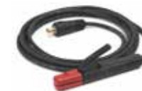
WELDING CABLE WITH ELECTRODE HOLDER E/H-300A-50-5M