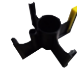
ADAPTER FOR SPOOL TYPE B300 K10158-1