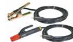
MMA KITS W000260683 W000011139