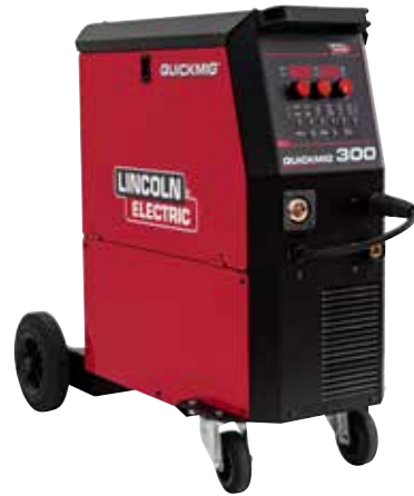
QUICKMIG® 300 300A@35%